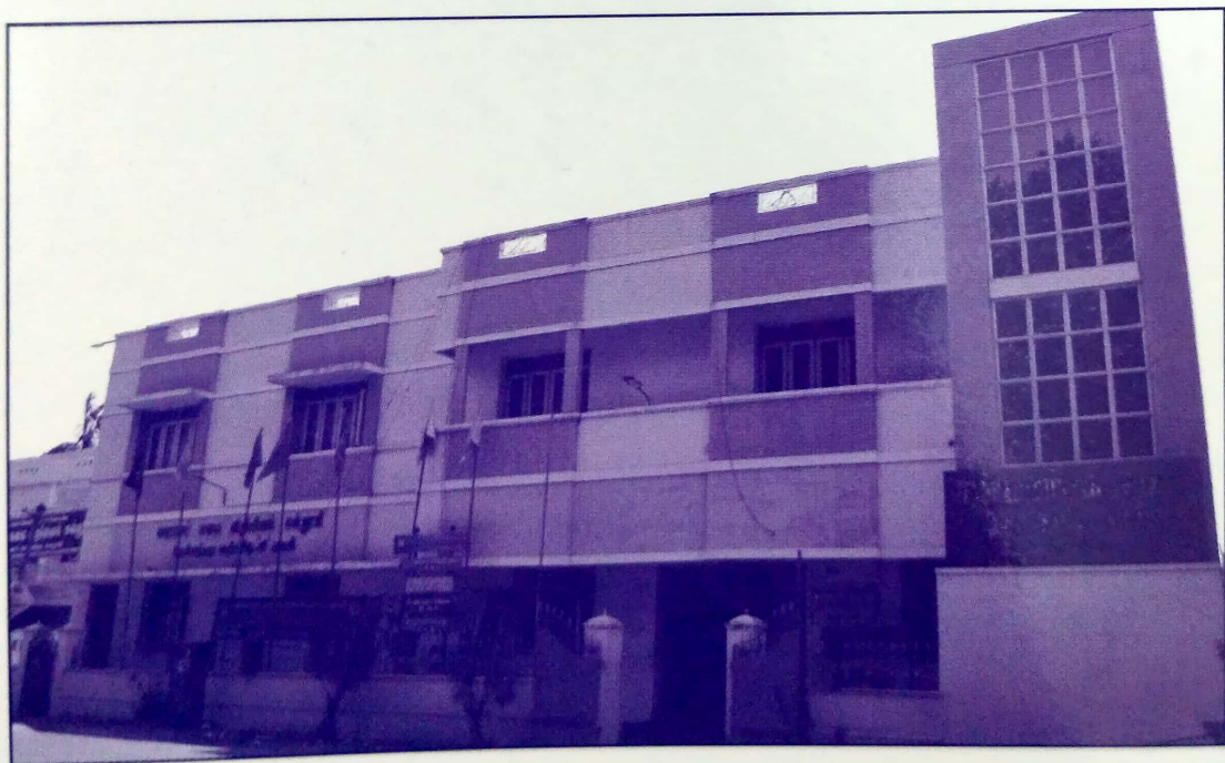
View of the College Building