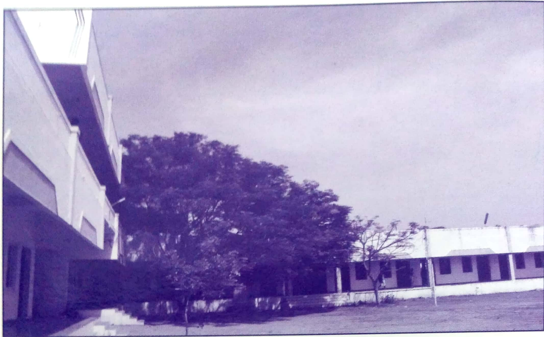
View of the College campus and the ground