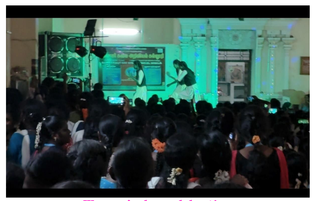
Women's day celebration

Ganesar College Of Arts & Science MELASIVAPURI - 622 408