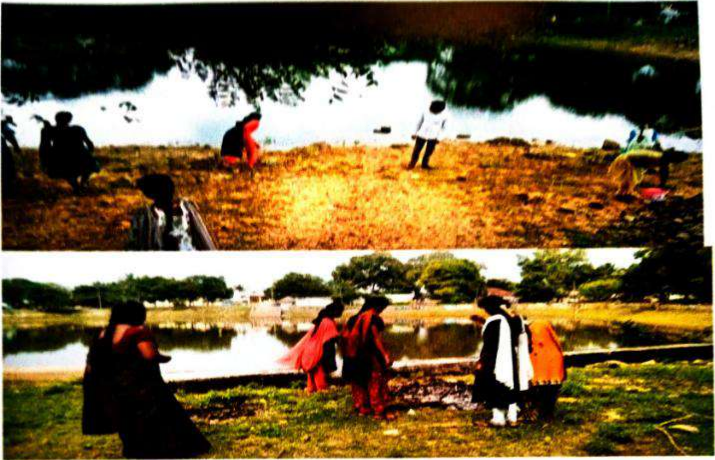
Glimpse of the event