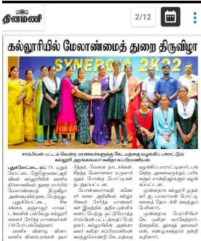
Our B.Com Students are Participate the intercollegiate meet at Department of Management Studies, JJ College of Arts and Science (Autonomous), Pudukkottai