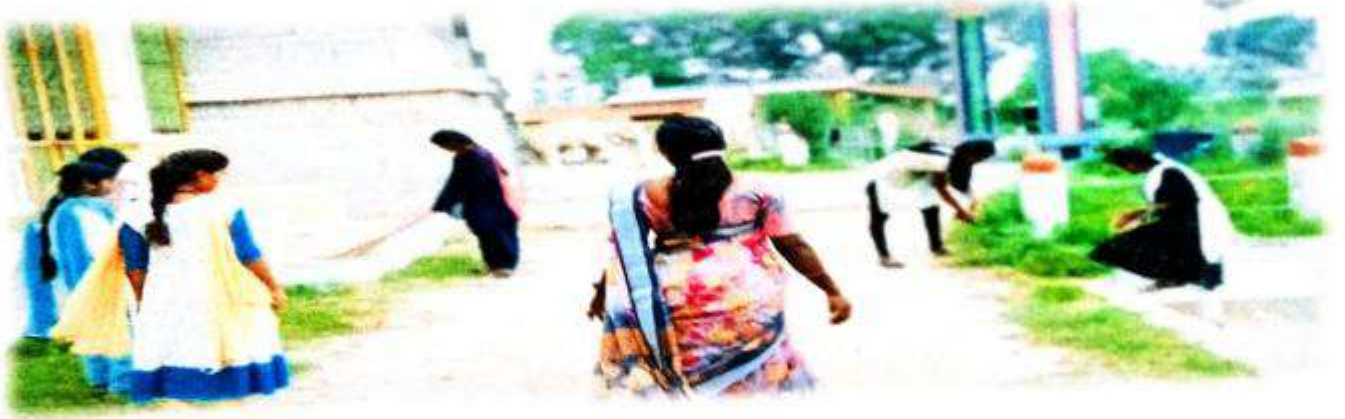
Glimpse of the event