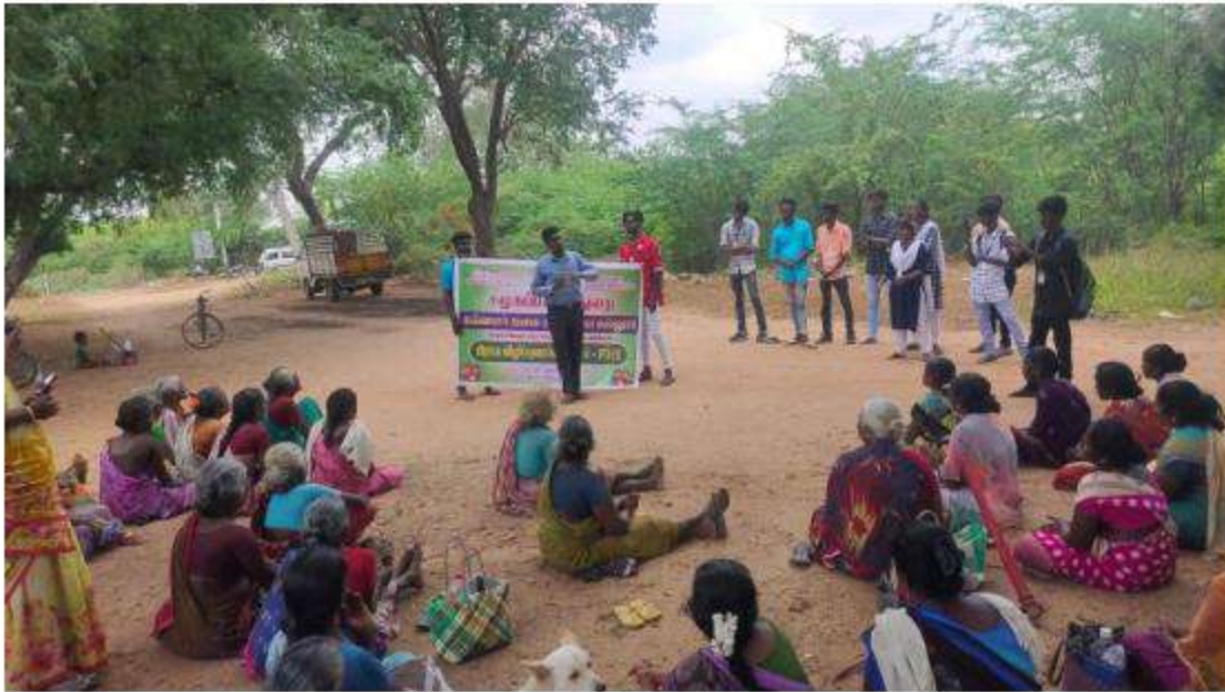
Rural camp at koppanapatti