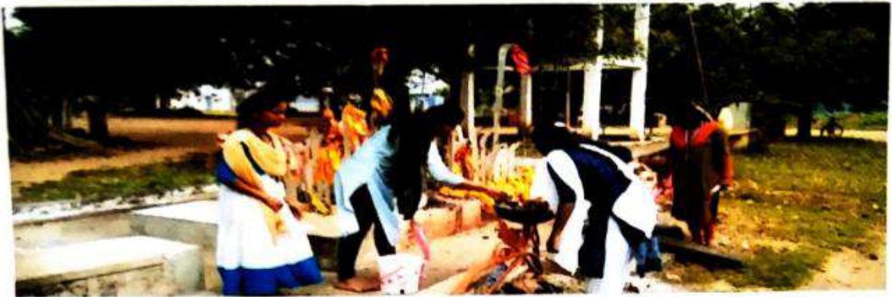
Glimpse of the event