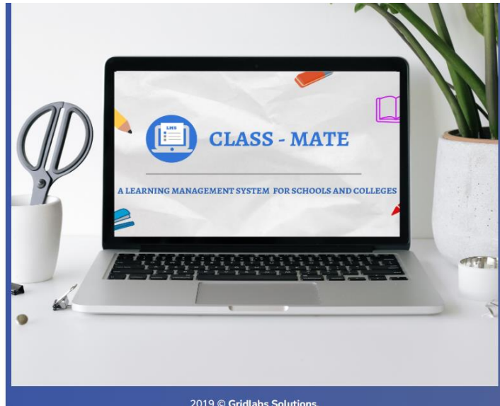
Screenshot of LMS software